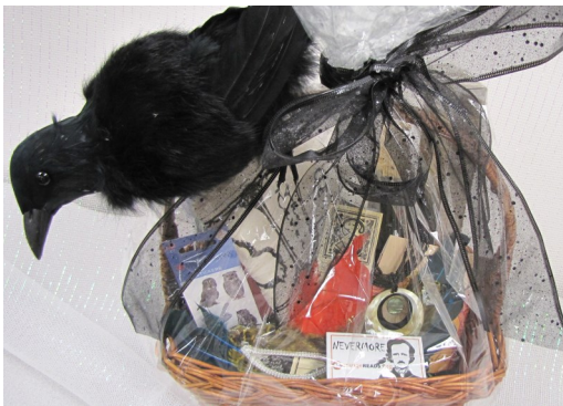
The Raven Basket

View photos of the baskets and ticket ordering information on the RCLS website .