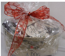
The Hound of the Baskervilles Basket

Seven literary-themed baskets are being offered in the RCLS Biblio Basket Raffle and YOU could be a lucky winner. Each one is overflowing with goodies and includes items designed and manufactured by Storiarts (an Oregon-based company whose sale of literary-themed products aids children worldwide in learning to read, write, and create)! Contents of each basket are valued at over $75.